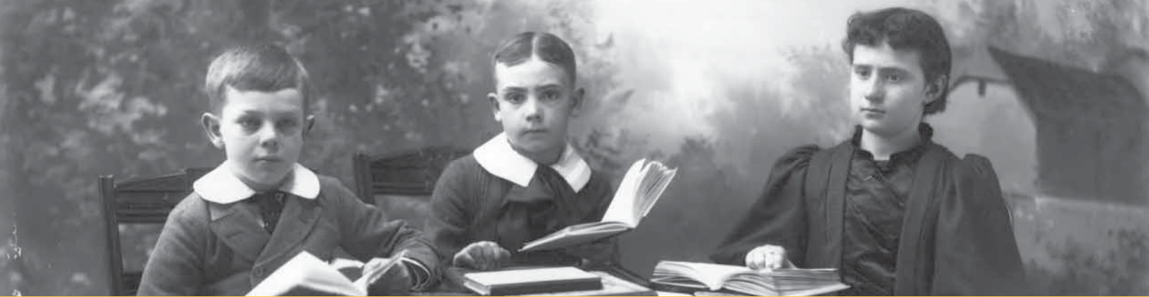
Students in the Early 20th Century