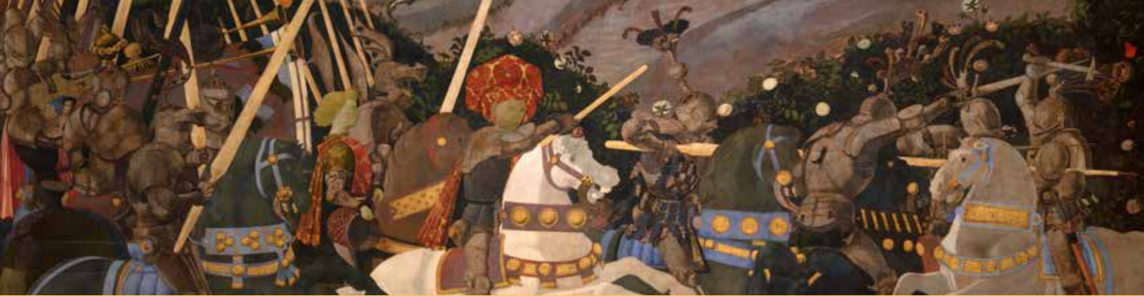
Detail from The Battle of San Romano, Paolo Uccello (Italian, c. 1440)