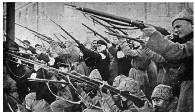
Russian Revolution, 1917