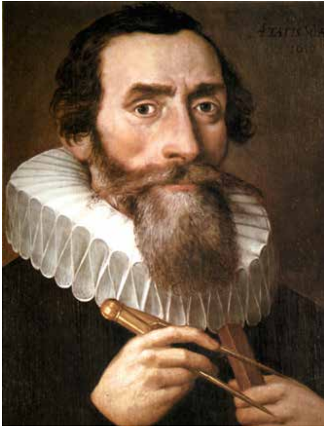
Johannes Kepler, German Scientist (1571-1630)