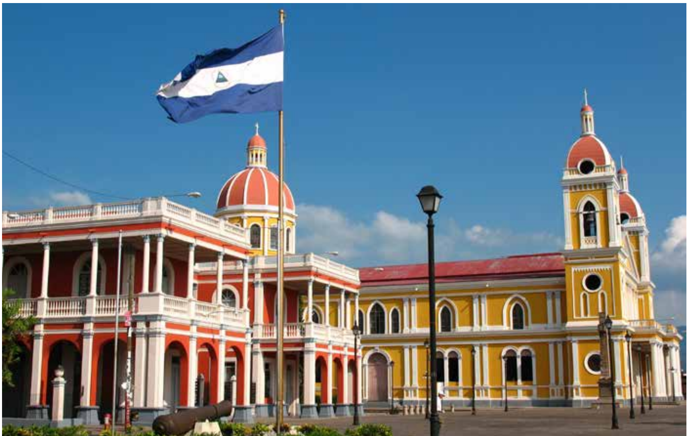
Plaza de la Independencia, Granada, Nicaragua