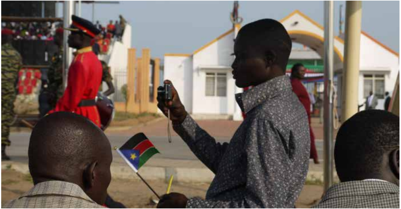
A man in South Sudan captures the day's festivities as his country becomes officially independent on July 9, 2011.