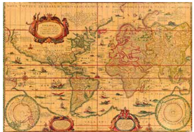
17th-Century World Map